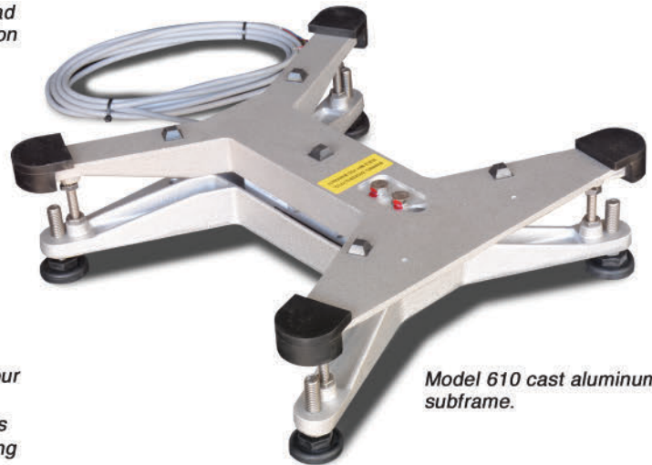
Model 610 cast aluminum subframe.