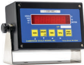
Match your scale with our Model CSW-10AT or CSW-10AT-B indicators for the ultimate weighing system.