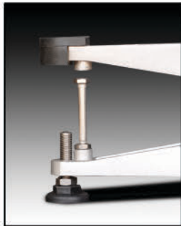
Close-up view of overload and corner load protection and vibration absorbing anti-skid leveling feet.