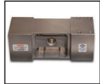
Hermetically sealed stainless steel load cell.