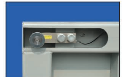
Self checking captive ball leveling feet.