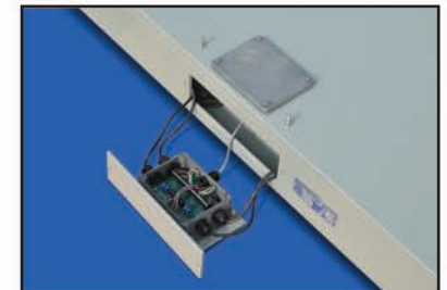
Easy access to side mounted polycarbonate NEMA 4x junction box.