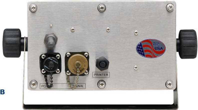
Cambridge Model SSCSW-10AT-B