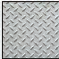
Glass bead finish