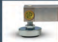
Standard leveling feet