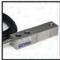
SS, hermetically sealed and/or "FM" approved load cells