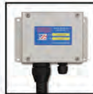
Remote stainless steel NEMA 4X junction box