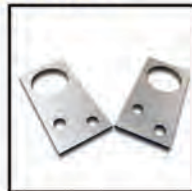
Lag down brackets* (sold individually)