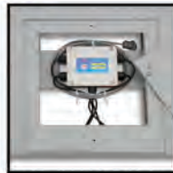
SS on-board NEMA 4X junction box AL660 "Classic" only