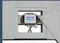
Top access junction box