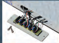
Side access junction board