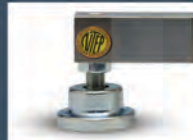
Captive ball leveling feet