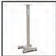
48" Indicator column* (Freestanding)