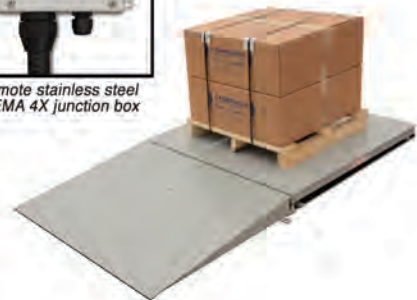
Model AL660 "Classic" series aluminum low profile floor scale shown with optional easy incline ramp.