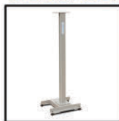
48" Indicator column (Freestanding)