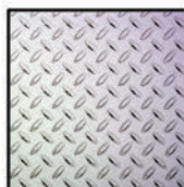
Stainless steel diamond deck plate