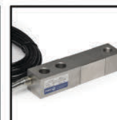
SS hermetically sealed and/or "FM" approved load cells