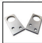
Lag down brackets (sold individually)