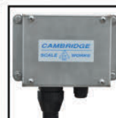
"FM" approved junction box