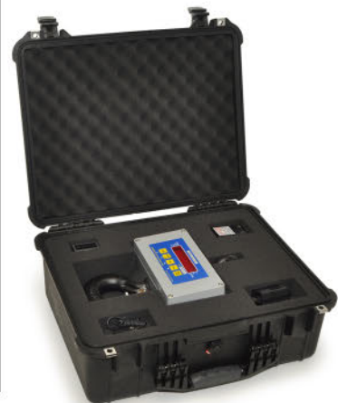
Optional Rugged Storage-Carrying Case shown with optional Spare Battery